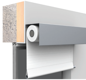
Roll-Ups mount above the window or door frame