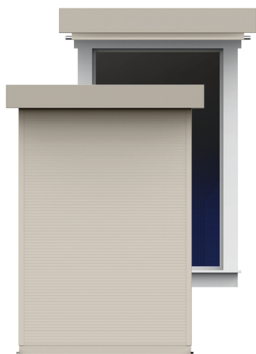
Roll-Up Window Shades