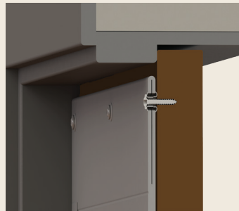
Mounts into door slab