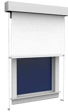
Cable guide retention