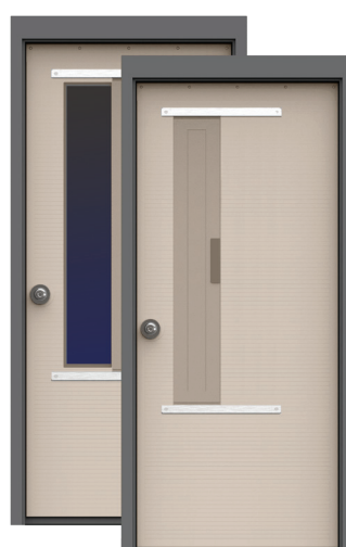
Fixed Panel Door Shields