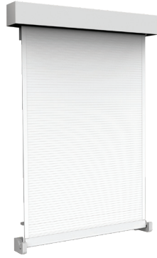
Locking hem bar retention