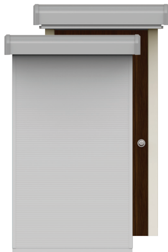
Roll-Up Door Shields