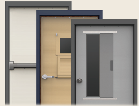
Accommodates all door types